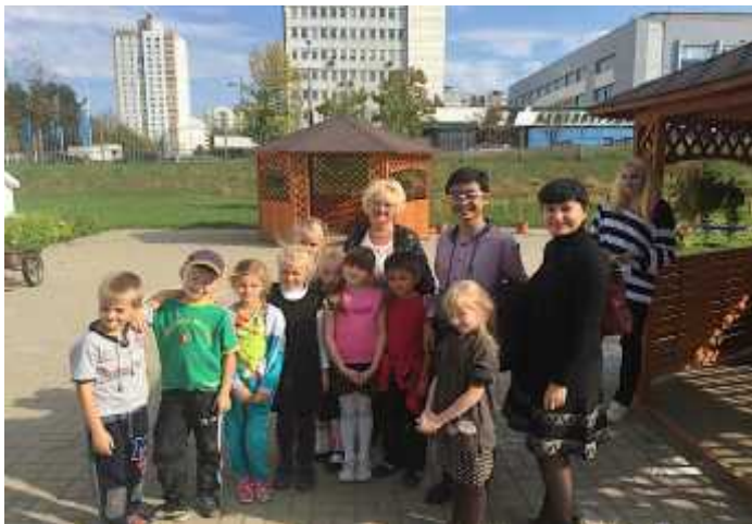
Student Visitors of The Facility

pretty interesting. In the room we discuss a lot about the cultures and habits of the two countries there. After the discussion, we then leave the Republican Center to head back to the car to our next visit.