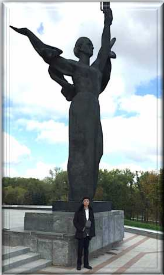
The Victory Hall Monument