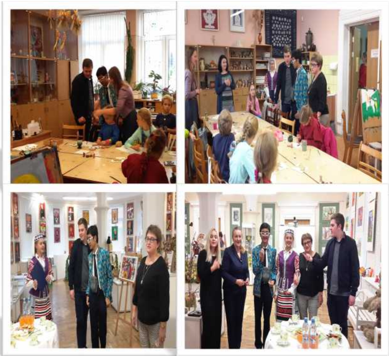
With Head, Officials and Student of The National Center of Children and Youth Art