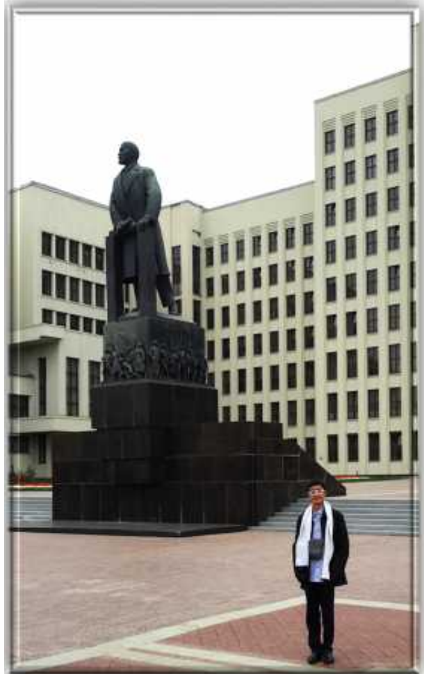
Me at Lenin Square