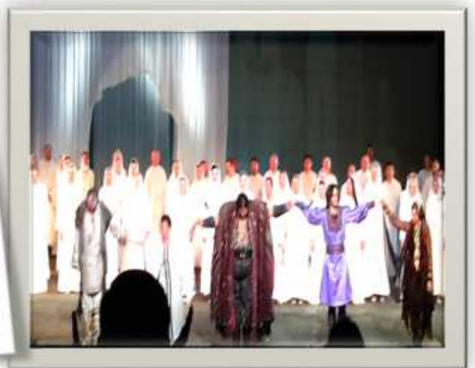
The History of Prince Igor