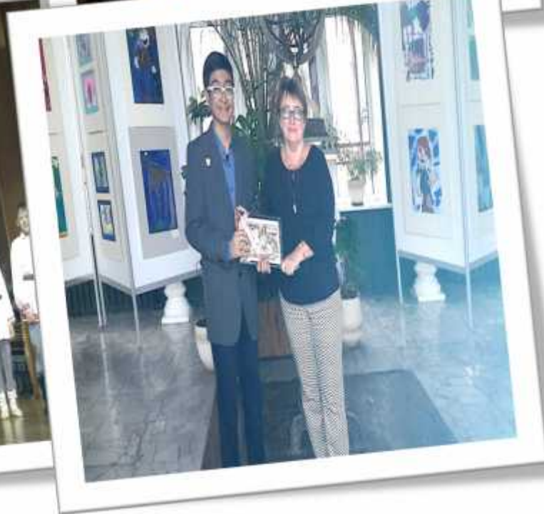
Traditional Art Performance from Indonesia and Belarus