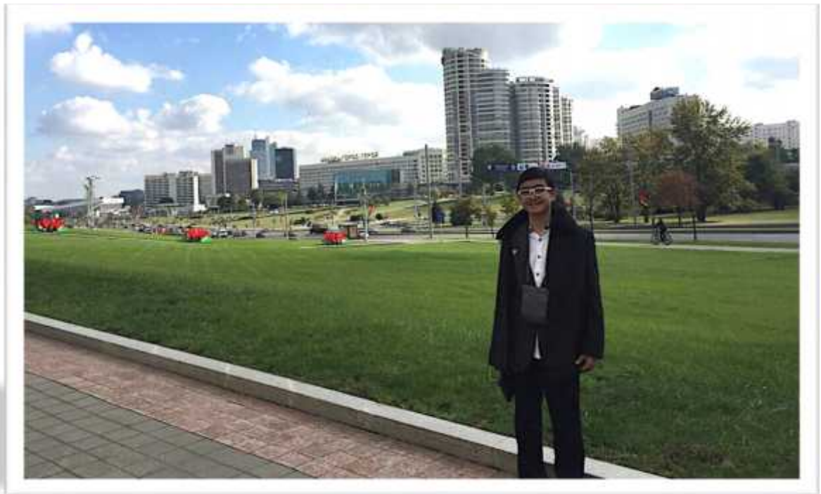
Minsk, Amazing & Well-Organized City.