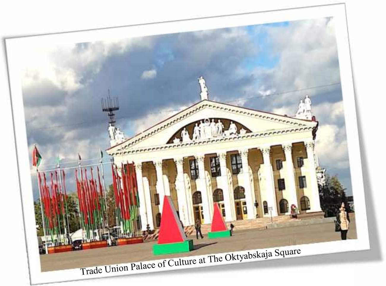
Trade Union Palace of Culture at The Oktyabskaja Square