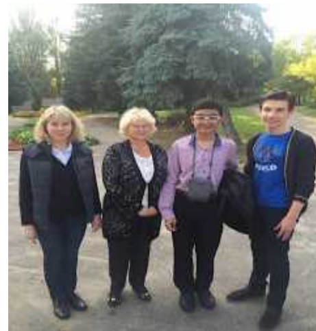
With the officials of The Republican Center of Ecology and Local Lore Studies